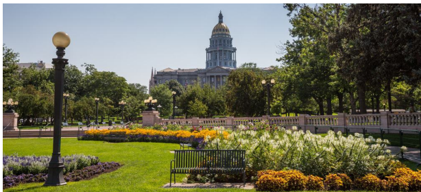
Civic Center Park