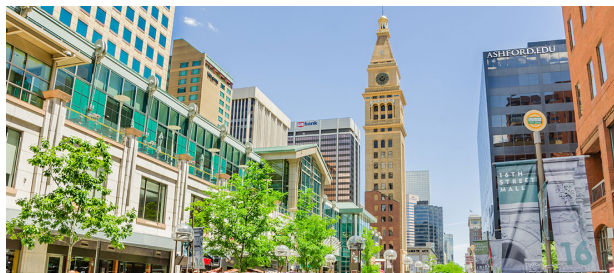
16th Street